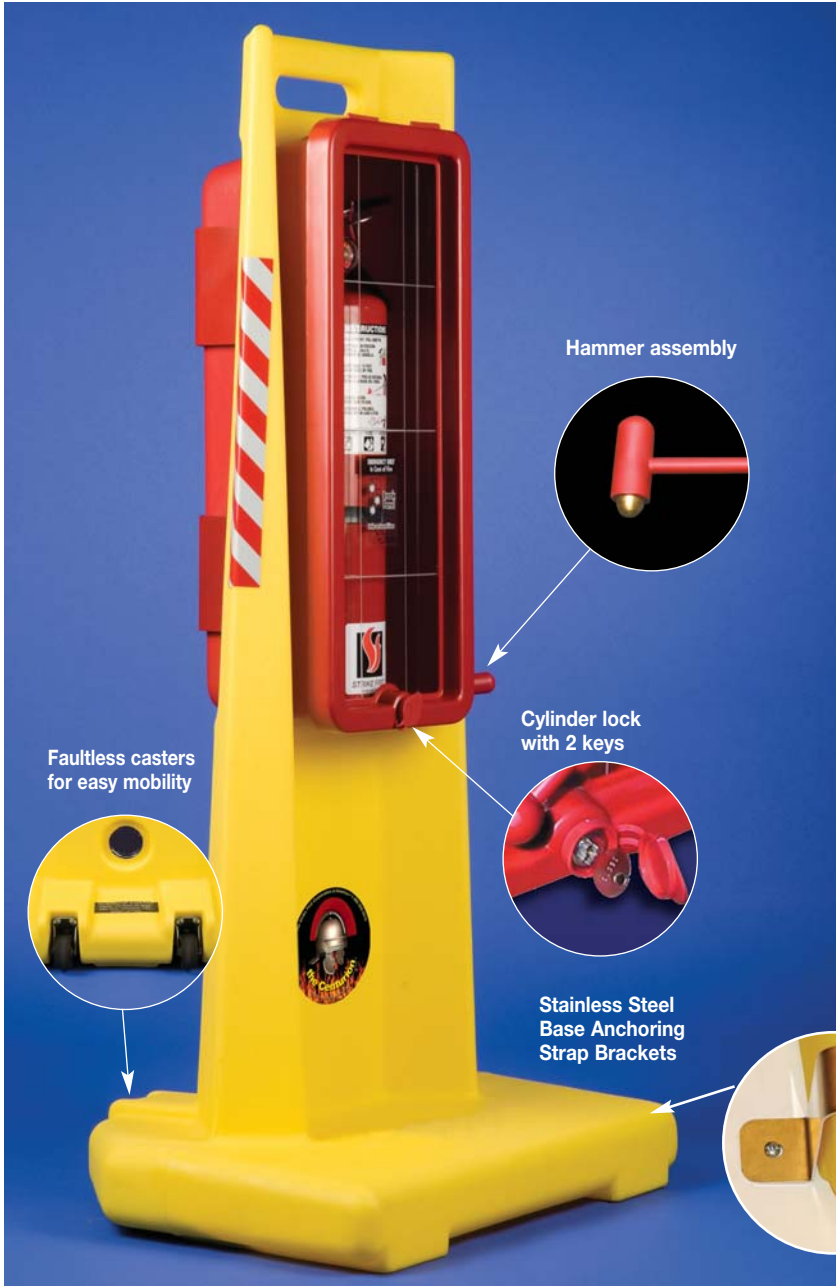
(Extinguisher not included)